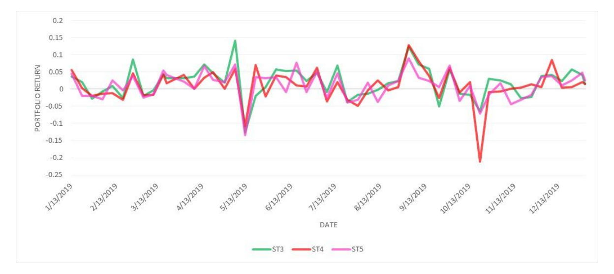
Fig 2. Comparison of strategy 3 with the benchmark strategies